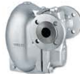
Float & Thermostatic Steam Trap