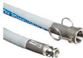
USDA - 3A Certified Sanitary Hose