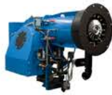
Boiler Burner Controls