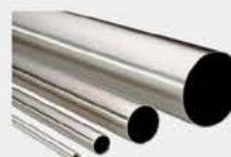
High Purity Tubing