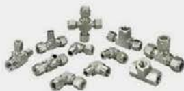
Swagelok Style Tube Fittings