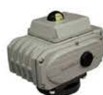
High Torque Output