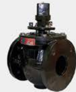
VSI Plug Valve