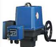
Capacitance Fail Safe