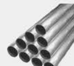
Stainless Steel Tubing