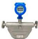
Coriolis Flow Meter