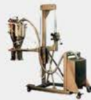
Mobile Pneumatic Conveying