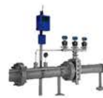
Validation System TekValSys