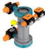
Ebro Cycle Lock