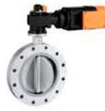
Ebro Impeller Valve