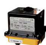
Fast Acting Rotary