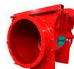
Rembe Isolation Valve