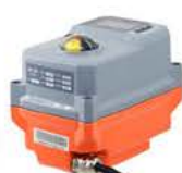
Compact, Failsafe, Modulating