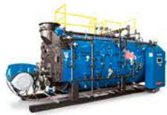
Industrial & Commercial Boilers