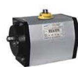
Spring return or double acting