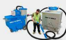
Explosion Proof Portable Industrial Vacuum