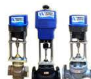
Fast Acting Linear